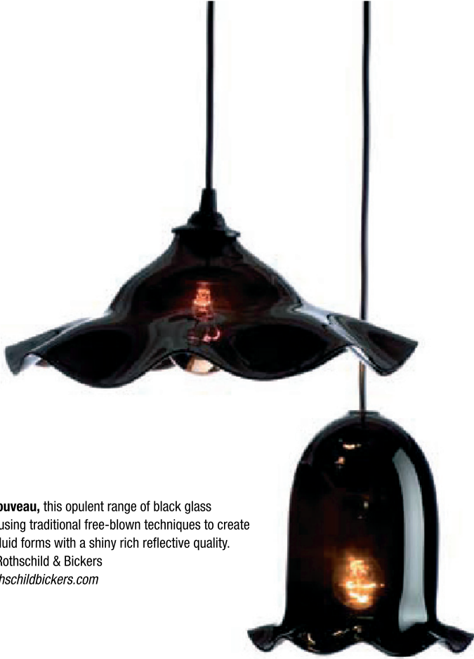
Black Nouveau , this opulent range of black glass is made using traditional free-blown techniques to create elegant fluid forms with a shiny rich reflective quality. Design: Rothschild & Bickers www.rothschildbickers.com