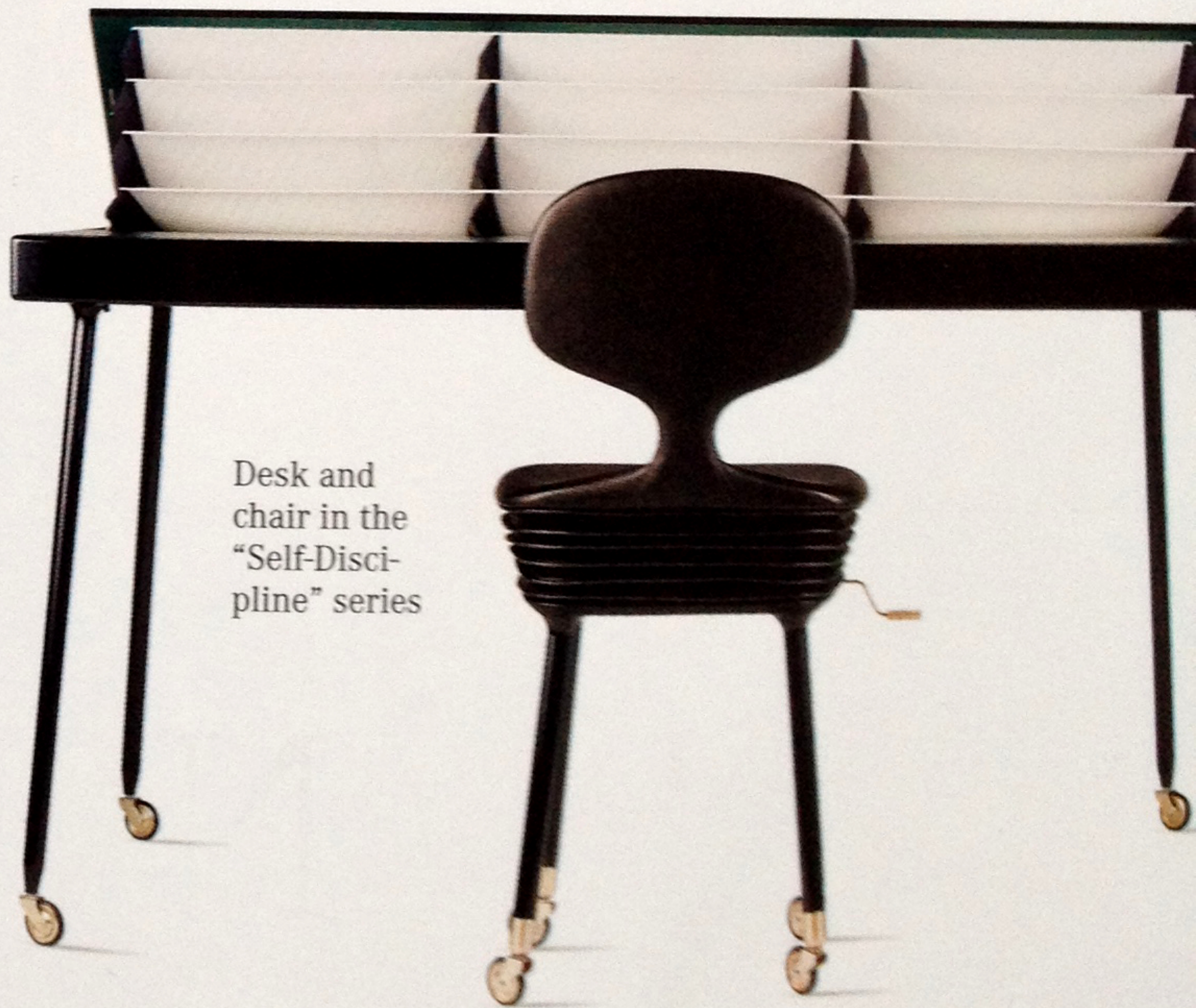
Desk and chair in the "Self-Discipline" series