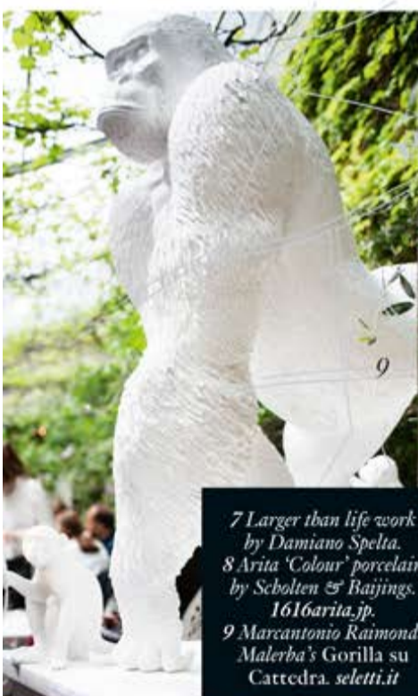
7 Larger than life work by Damiano Spelta. 8 Arita 'Colour' porcelain by Scholten & Baijings. 1616arita.jp 9 Marcantonio Raimondi Malerba's Gorilla su Cattedra. seletti.it

HOUSED IN AN OLD TIE FACTORY IN A MOSTLY RESIDENTIAL AREA, SPAZIO ROSSANA ORLANDI HAS FRONT GATES EMBLAZONED WITH ITS INITIALS IN RED. THIS RABBIT WARREN OF ALTERNATIVE DESIGN IS RUN BY THE FABULOUSLY FLAMBOYANT 'RO' HERSELF. IF IT'S NEW AND INTERESTING, IT'S HERE.